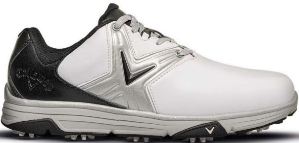
M585-50 WHITE / BLACK

A core Chev product that won't let you down! Built for maximum comfort whilst being lightweight and waterproof.